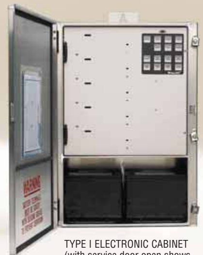
TYPE I ELECTRONIC CABINET (with service door open shows control panel and battery tray with optional batteries).