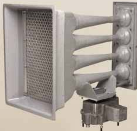
VORTEXR4 cell speaker housing mounted on rotor.

Other features are dependant upon one or two-way controls. Whelen equipment can be interfaced with many different types of two-way radio communications products and systems including 800Mhz trunking, Motorola's MOSCAD, FSK, Narrow-Band and VHF Low Band. The following is available as standard options. Contact factory for special applications.